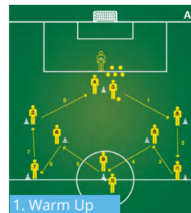
1. Warm Up

Players #3 & #4 as well as the goalkeeper(s) at the starting position The players pass the ball around in a 'logical' sequence (1-8)